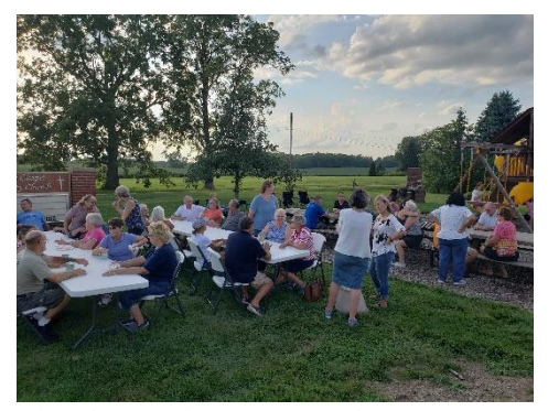
cleaning and mortar repair on our outdoor bulletin board.

Great Work PC (AGAIN)! The church collected a lot of supplies to be taken to Kentucky to the community of