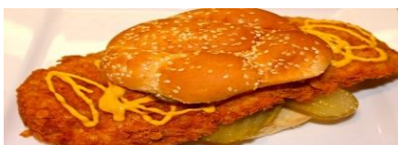
Tenderloin Supper Nov 13 4-7pm