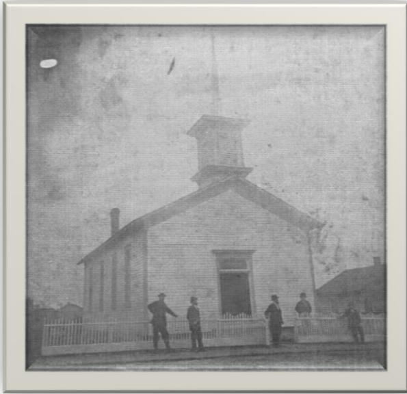
Pleasant Chapel c. 1846