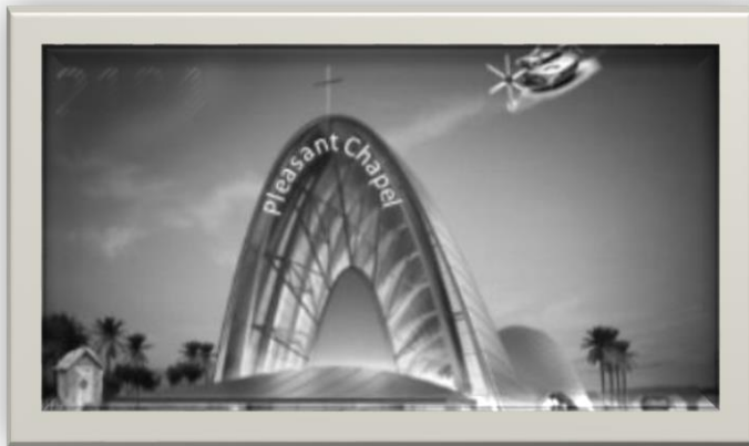
Pleasant Chapel c. 2194

Pleasant Chapel Celebrating 175 Years Repurposing lives since 1844