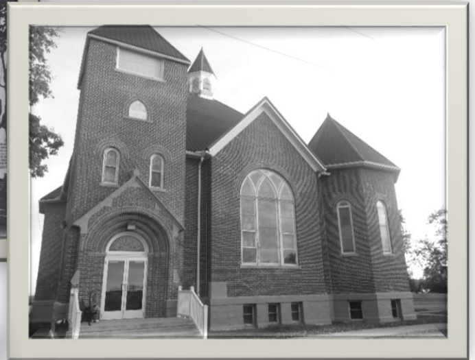
Pleasant Chapel 2019