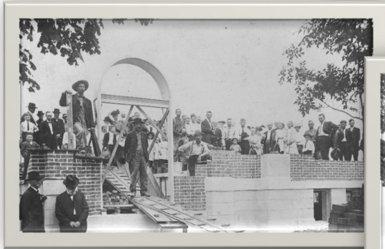
Pleasant Chapel 1910