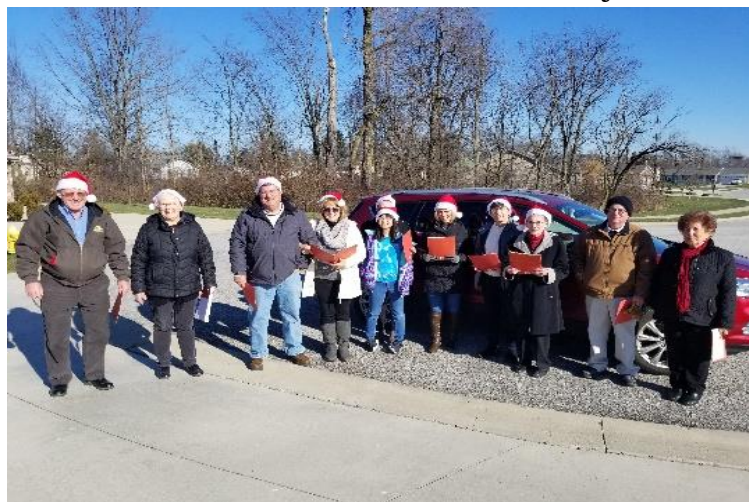
Christmas Caroling. The weather was nice and all

Below is information regarding each organization in order for you to become better acquainted with their operation.