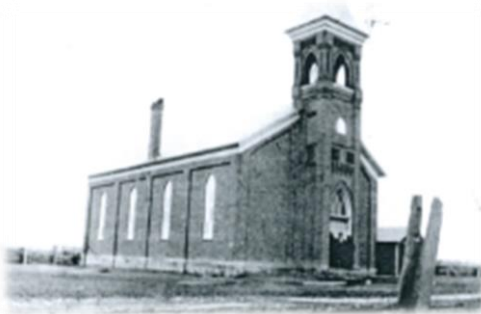
Pleasant Chapel circa 1884

These are the kind of things we want to compile, preserve, and share. Do you have any old photos of the church? Or do you have documents relating to the history of the church? Or do you have stories about this church's past?