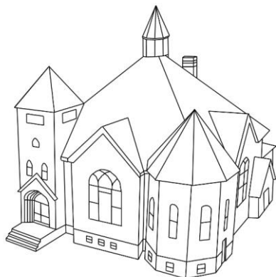
Pleasant Chapel Version 4.0

Tenderloin Supper – Yep we’re going to do it! April 17 th from 4-7. The supper will be drive-thru and pickup like last fall’s supper. This time we will not presale tickets though. People will come, purchase their tickets in their cars ($10), make their selections, and then pick up their meals in to-go boxes. Please consider signing up to help with this FUN EVENING. Contact Tammy Lickey for more information.