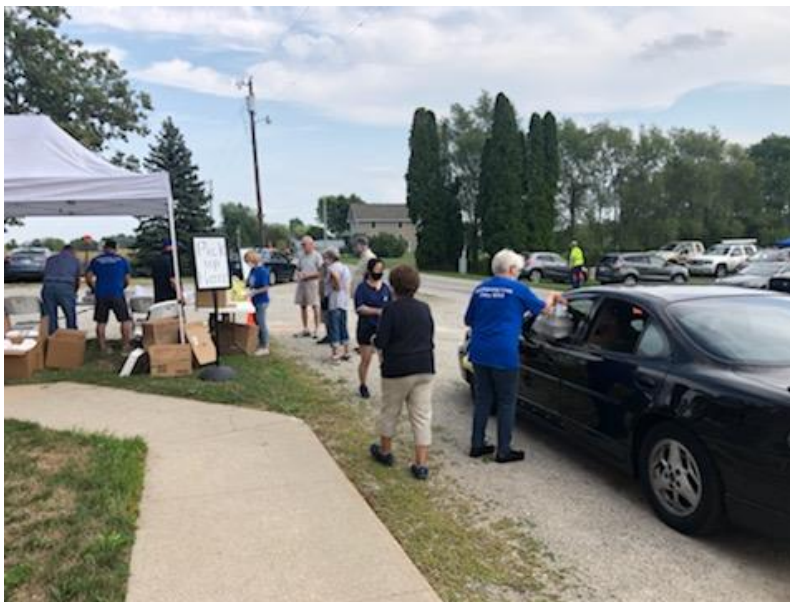
Pleasant Chapel modified its traditional Tenderloin Supper in order to maintain safety due to COVID-19.

The Board has been asked to consider each item and the discussion prayerfully. They are seeking to discern God's will for Pleasant Chapel. You are asked to pray through this process as well. Pray for this church, pray that God would make known his purpose for the church. Pray that God would be gracious to this church in order for it to be most effective. Pray for the Executive Board as they work through this process.