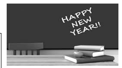
and begins a new one late September / early October.

When does your year start? For most, the year starts January 1. It is the beginning of a new calendar year and is celebrated all over the world. The Jewish calendar ends its year